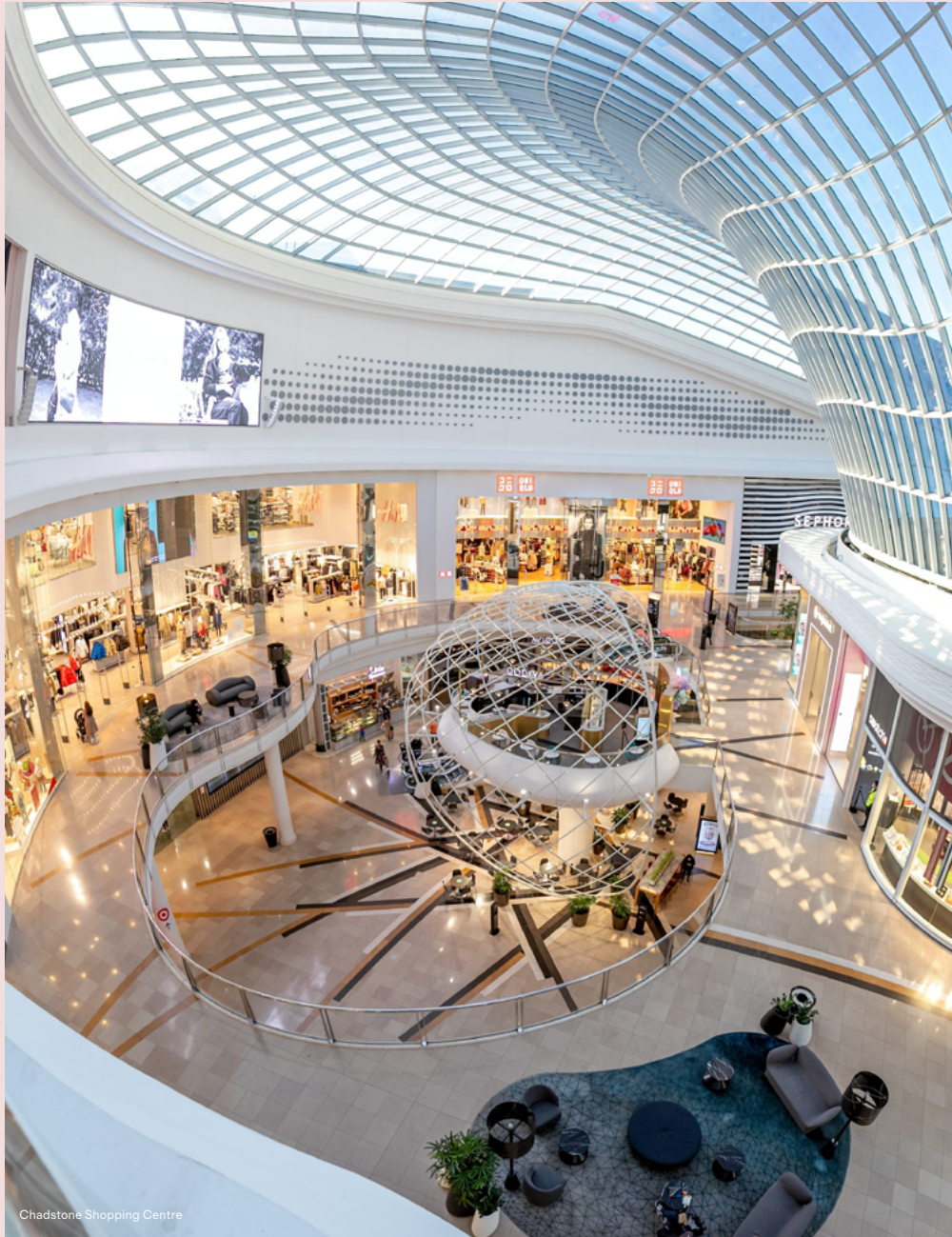
Chadstone Shopping Centre