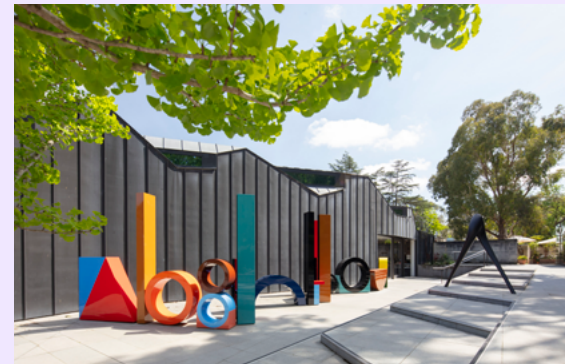
Heide Museum of Modern Art, 2019

The former home of Sunday and John Reed, Heide hosted many of Australia's most renowned artists, including Sidney Nolan, Joy Hester, Albert Tucker and John Perceval. It is now a public art museum and sculpture park, with a lovely café onsite that offers breakfast and lunch. You can also grab takeaway and enjoy it in the extensive grounds.